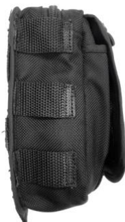
MOL2-CB2-NY2-DR SIDEVIEW (with piggyback straps)