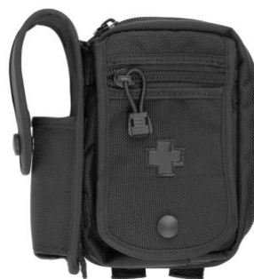
MOL2-CB2-NY2-DR (shown with piggyback module)