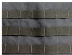
Standard molle vest with 1" x 1" docking sections

Combine that with our docking system that prevents any case movement on the vest and you have a tactical situation that any time you access your gear it's in the same spot – every time . This develops muscle memory, which is especially important for those time-critical situations.