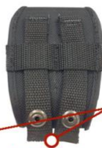
Wider cases have 3/4" nylon band and two snaps